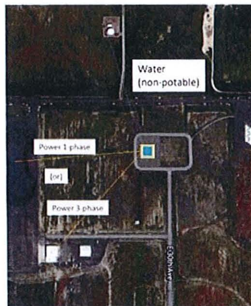
Figure 4 – Test Cell Location – Relative to Power & Water Sources