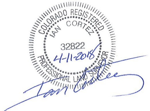
Exhibit "B" attached and hereby made a part thereof.