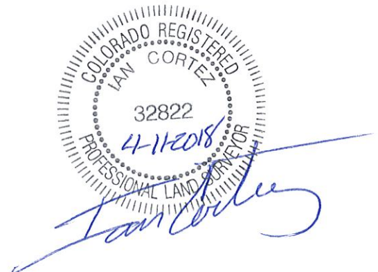
Exhibit "B" attached and hereby made a part thereof.