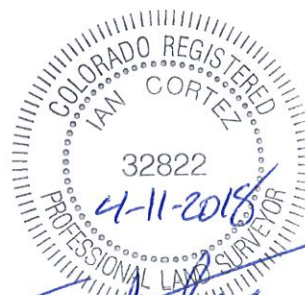
Exhibit "B" attached and hereby made a part thereof.