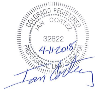
Exhibit "B" attached and hereby made a part thereof.