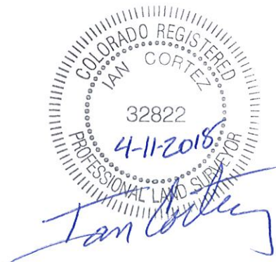
Exhibit "B" attached and hereby made a part thereof.