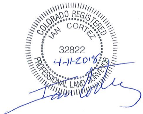
Exhibit "B" attached and hereby made a part thereof.