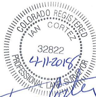
Exhibit "B" attached and hereby made a part thereof.