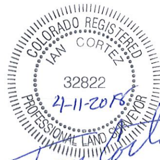
Exhibit "B" attached and hereby made a part thereof.