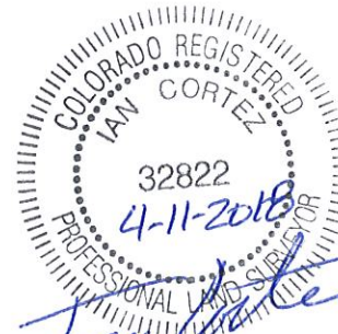
Exhibit "B" attached and hereby made a part thereof.