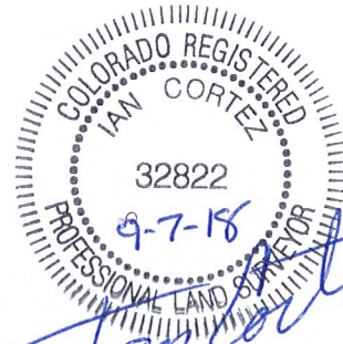
Exhibit "B" attached and hereby made a part thereof.