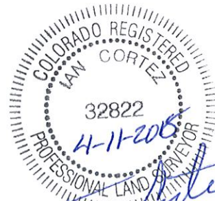
Exhibit "B" attached and hereby made a part thereof.