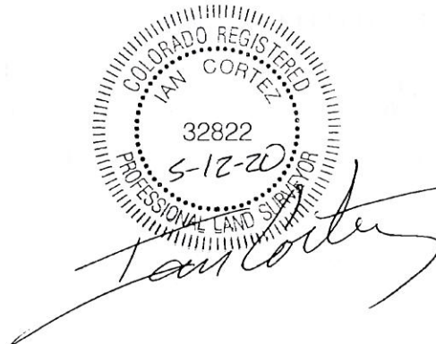
Exhibit "B" attached and hereby made a part thereof.